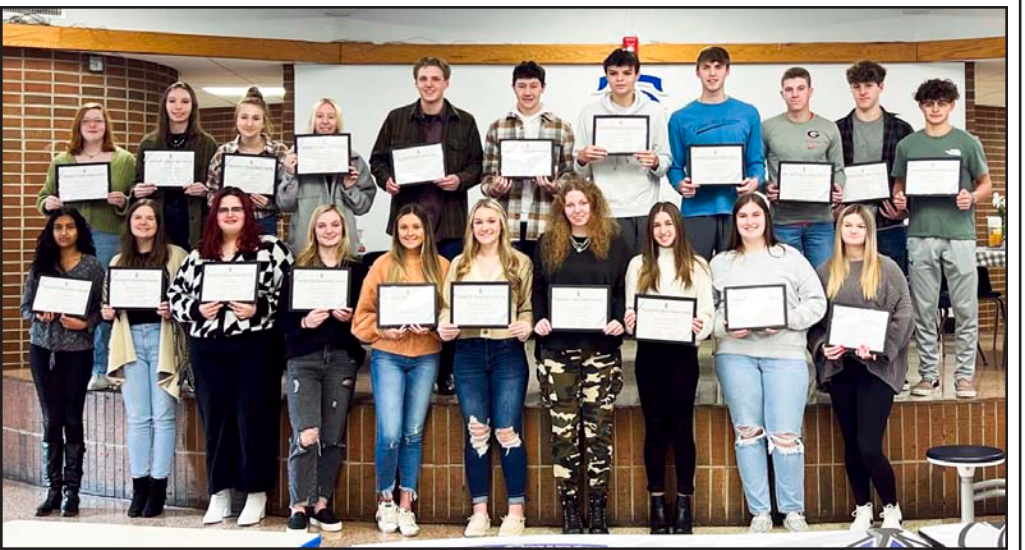
National Technical Honor Society 2023 Inductees from Towns County High School

Congratulations on this great achievement!